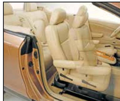
Power forward/backward seat adjustment