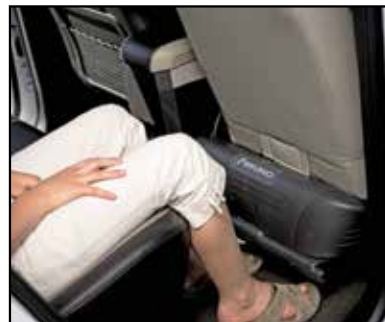
A smaller footprint and lower unit profile means more legroom for first and second row passengers.