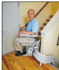
CUSTOM CURVED RAIL STAIRLIFT