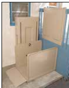
VERTICAL PLATFORM LIFT