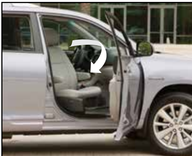
The seat rotates...