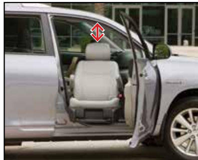
...then automatically reclines to provide head clearance...