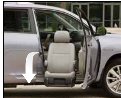
...as it comes out of the vehicle and lowers to the desired height!