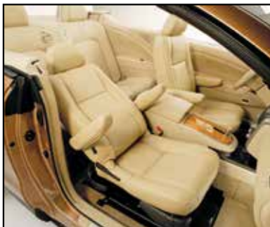
Full recline with levers on both sides