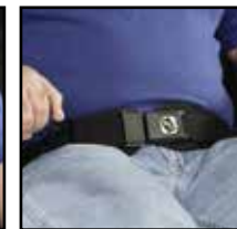
Padded Hip Positioning Belt