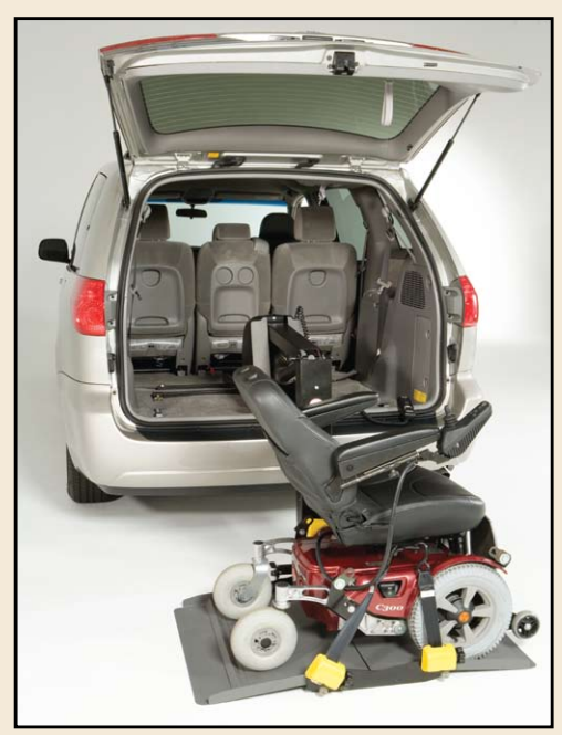
Front-Wheel/Rear-Wheel Drive Powerchairs