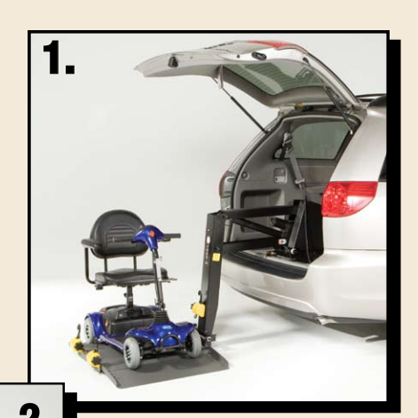
Raise platform and secure the belts...