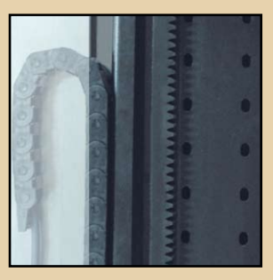
Heavy-Duty Cable Carrier (shown "through" steel enclosure) – provides protection for power cable