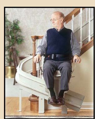
ELECTRA-RIDE™ III CUSTOM CURVED RAIL STAIRLIFT