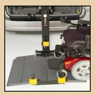
Easy Drive On/Drive Off Platform – designed for every type of mobility device. Selfleveling for uneven surfaces. Access either side of platform. No reversing necessary