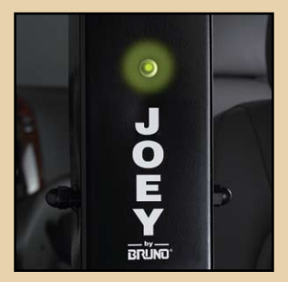
Indicator light – illuminates when Joey is safely docked and transport ready