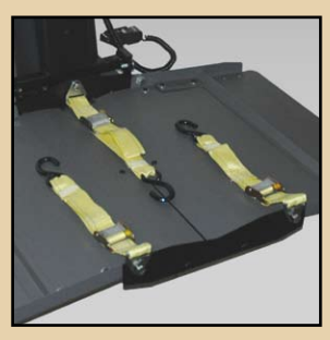
Securement belts – designed for one hand operation. Keeps your mobility device safely stowed (optional retractable belts also available)