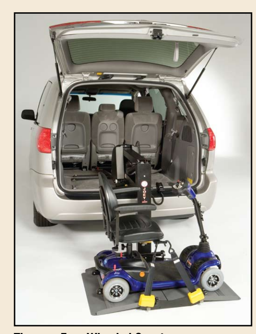
Three or Four Wheeled Scooters