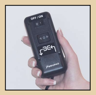
Hand-held pendant with single switch control