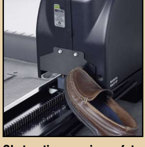
Obstruction sensing safety plate – disables unit when activated