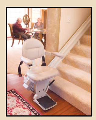
ELECTRA-RIDE™ ELITE STAIRLIFT