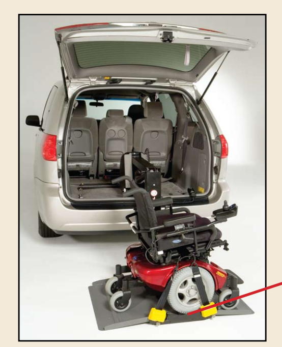
Mid-Wheel Drive Powerchairs