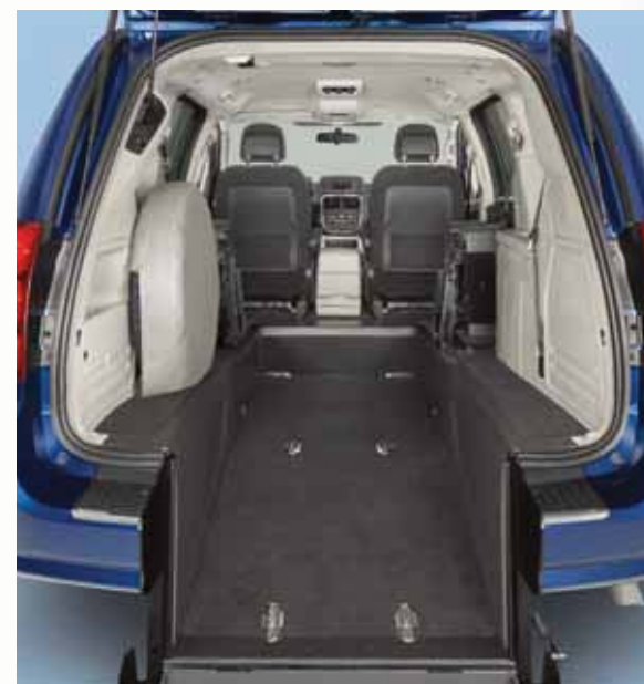
. . . to provide up to two wheelchair securement positions.