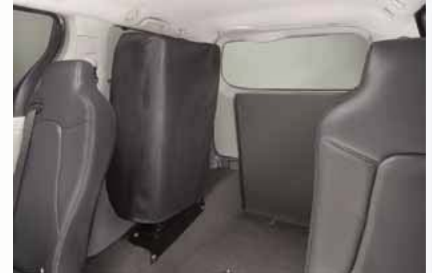
. . . or another wheelchair securement position when needed.