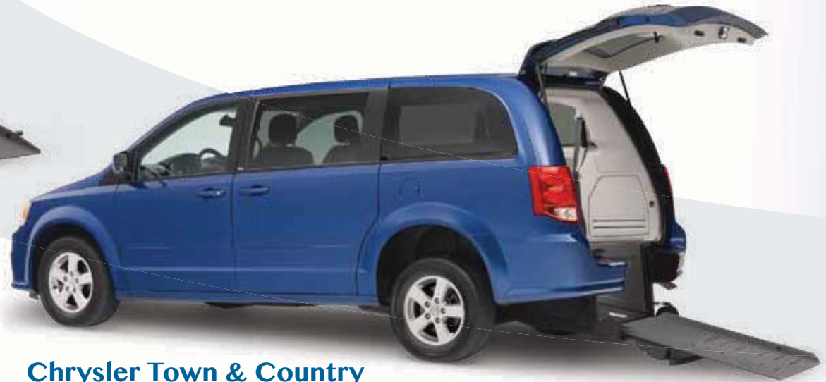
Chrysler Town & Country Dodge Grand Caravan