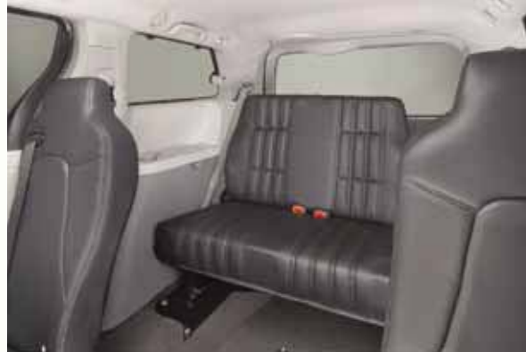
An optional third-row bench offers ambulatory seating . . .