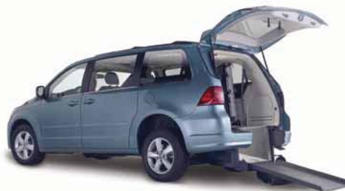
The Vision conversion is also available on the Volkswagen Routan