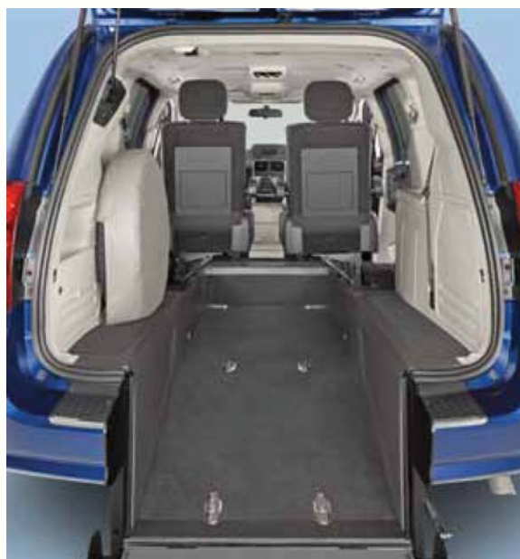
Remounted second-row factory seats flip-and-fold easily . . .